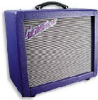
Goin' Back to Chicago...

Controls on the Kingston include High- and Low-gain 1/4" inputs, Volume, Bass and Treble controls, a Bright switch, and a switch for Harmonic Boost, Reverb, as well as the standard power and standby switches. Other notable features include an 18' heavy duty power cord, extra large rubber feet, a 4-ohm external speaker output jack and a slave 1/4" output jack with a padded speaker signal for running into another amp or processor.